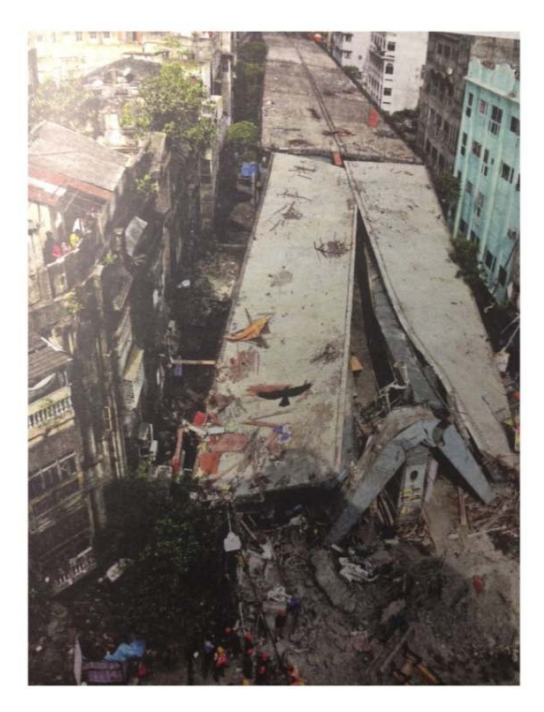
Figure 1. The overpass in Kolkata that collapsed in April 2016. The fact that such a road solution (through the old walking city fabric) could be considered in 2016 shows that the Modernist approach to infrastructure is still alive and well.

The Functional City and its Manuals of Modernism spread across the world like wildfire. Universities began teaching traffic engineering and town planning with all of its pseudoscience. Town Planning legislation enabled the processes to be made legal and the professionals who produced the numbers were treated like the doctors of city growth.